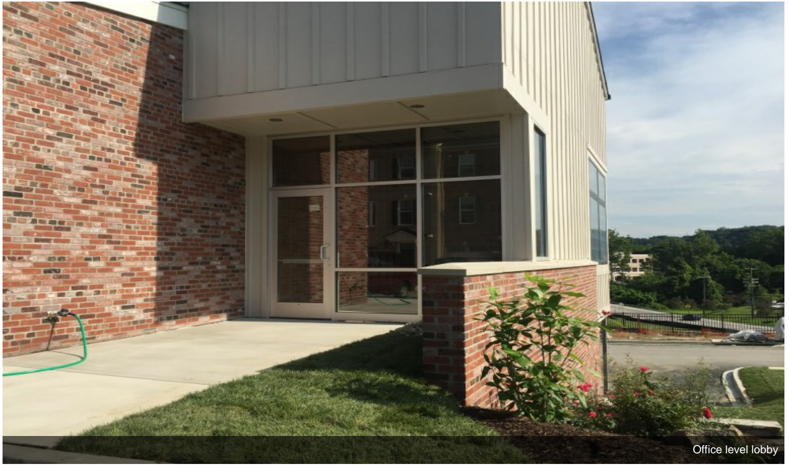
Office level lobby