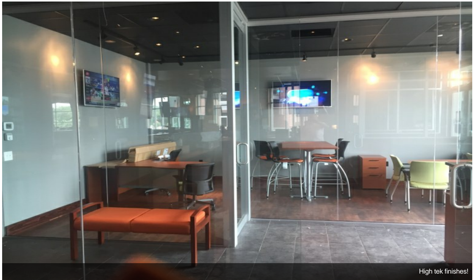
High tek finishes!